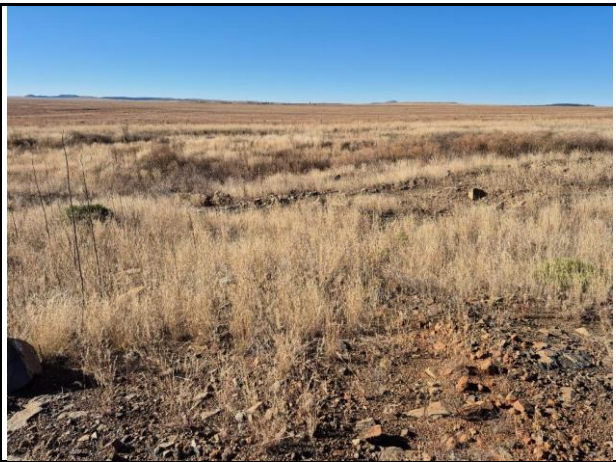
Rehabilitated \pm 0.7 ha of the excavation