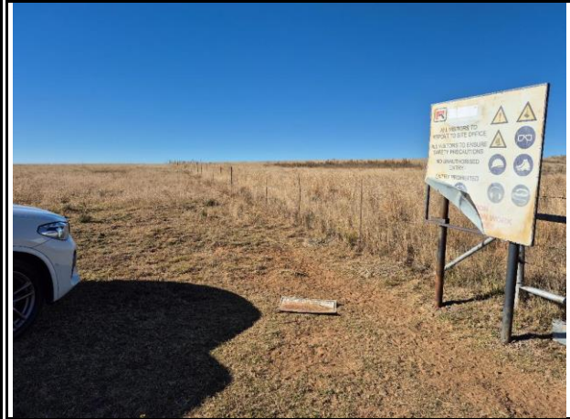
Signage at the entrance to the site