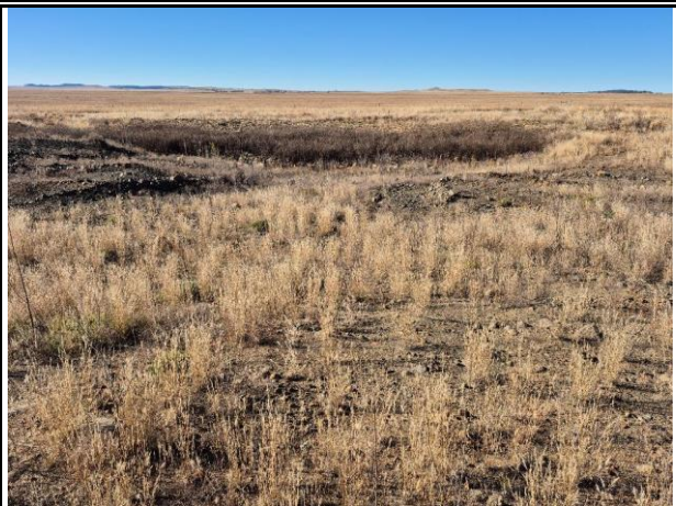
\pm 0.8 ha of the excavation that still require final rehabilitation